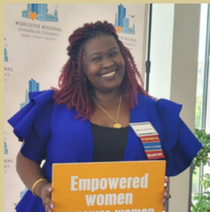
Food Pantry Coordinator