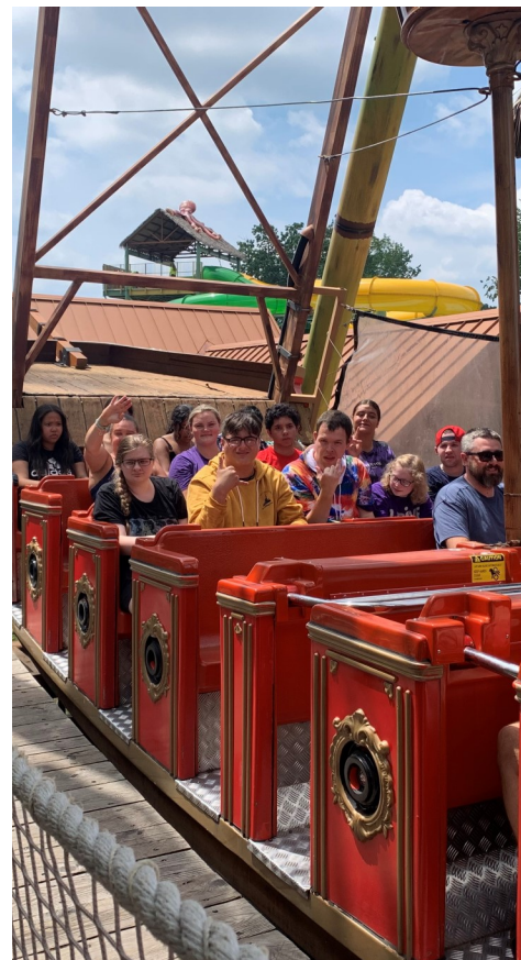
Check out the fun! And the smiles!