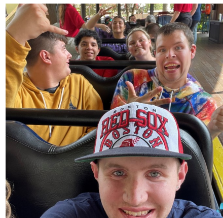
Canobie Lake Park trip!

Program Fee: $15/ Woo Pass: Free Love playing games? This is your opportunity to be part of the Worcester Gaming Group experience.