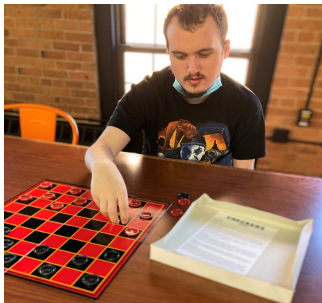
Day Program Worcester