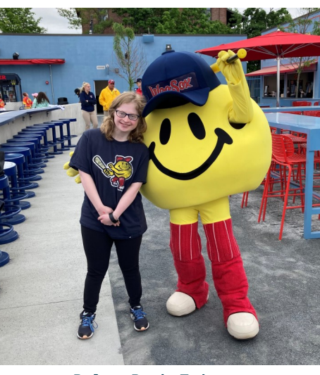
Polar Park Trip

Experience different locations in the greater Marlborough area while meeting new people and making friends. Bring your own spending money!