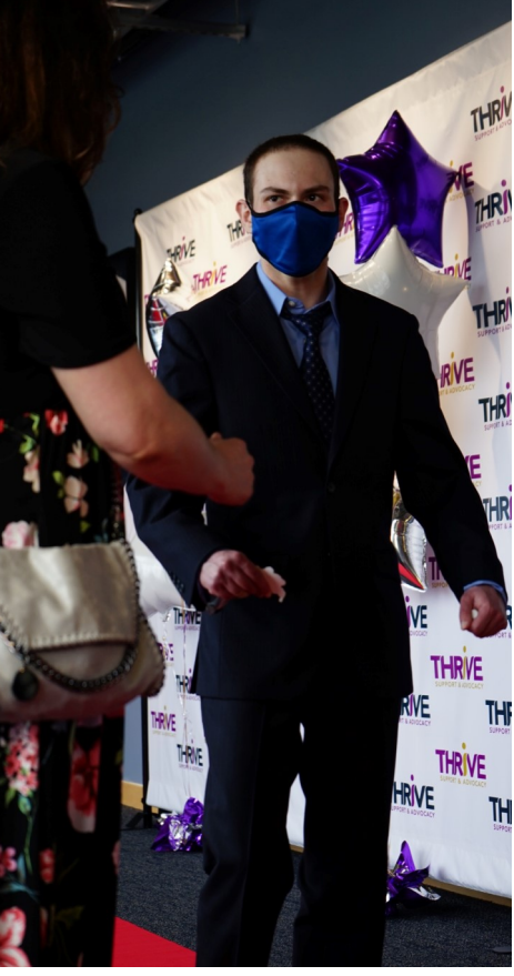
Check out the suits! All dressed up at Thrive's Prom for All Ages.