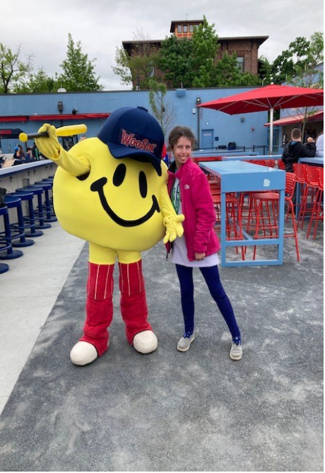
Thrivers at Polar Park Worcester